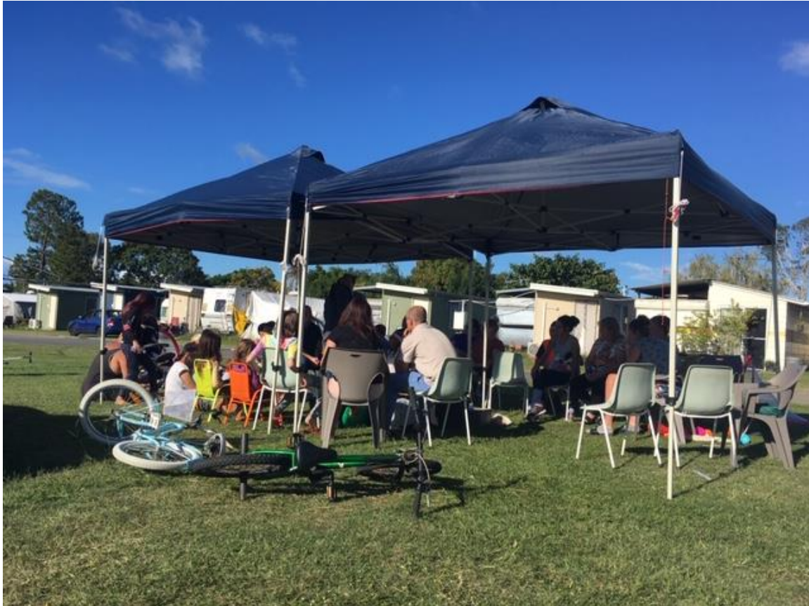
FIGURE 6: A FORTNIGHTLY BBQ AT CABIN ONE

having the right attitude, personality and an obvious relatability, which enabled a certain sociability in the residential park setting. The role of Cabin One as a vital community space will be discussed further on in the report. Here, it is helpful to note that it has become a site of weekly “ritual” gatherings where the Project Worker and community members engage in “chewing the fat” (Fortnightly report, week 26).