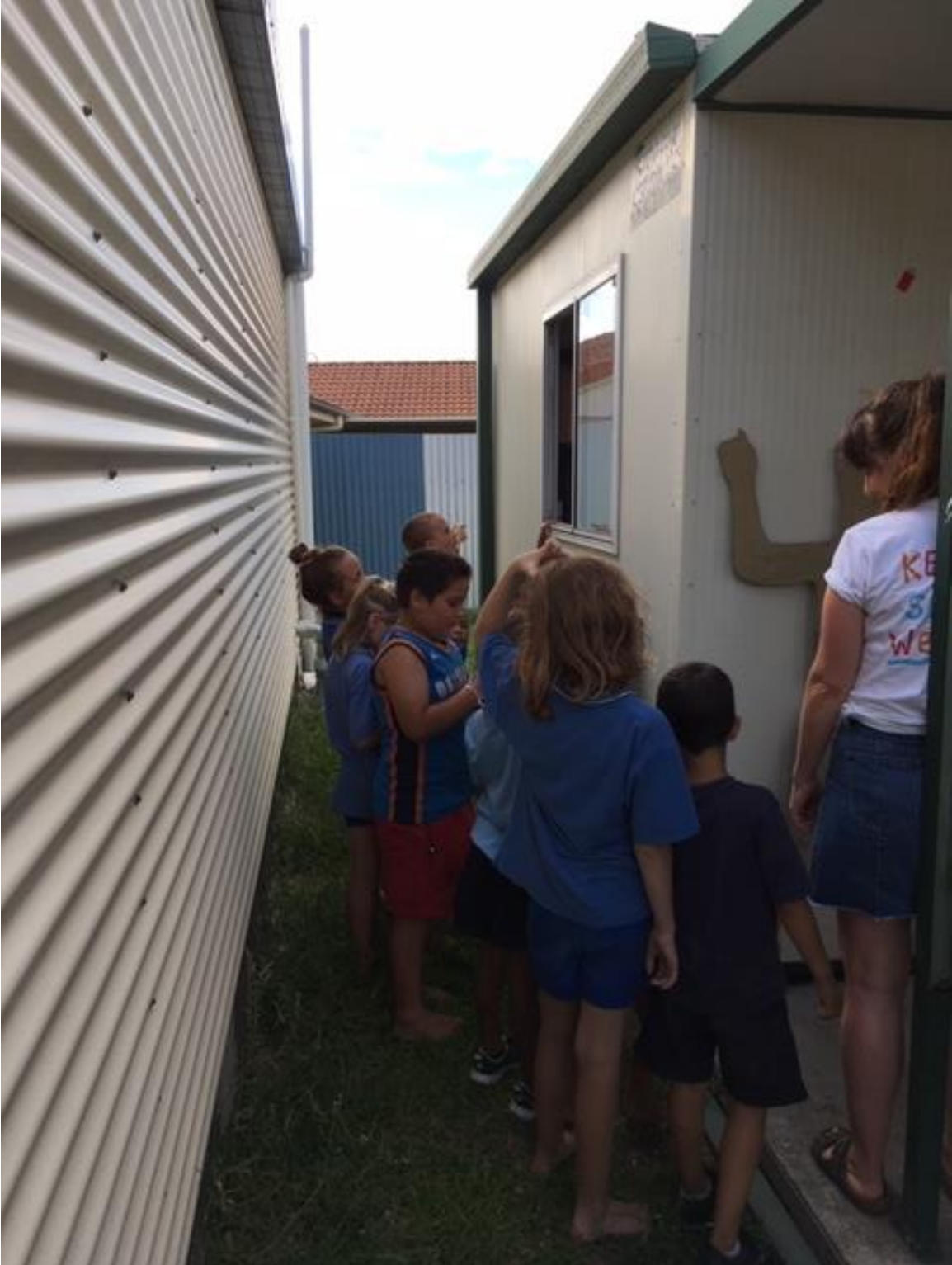
FIGURE 5: CHILDREN ORGANISE FOR ICECREAM