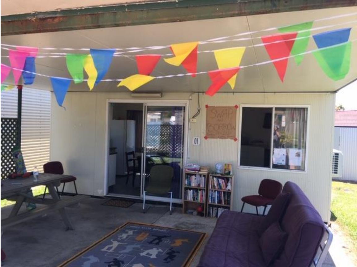
FIGURE 7: CABIN ONE – THE THIRD PLACE