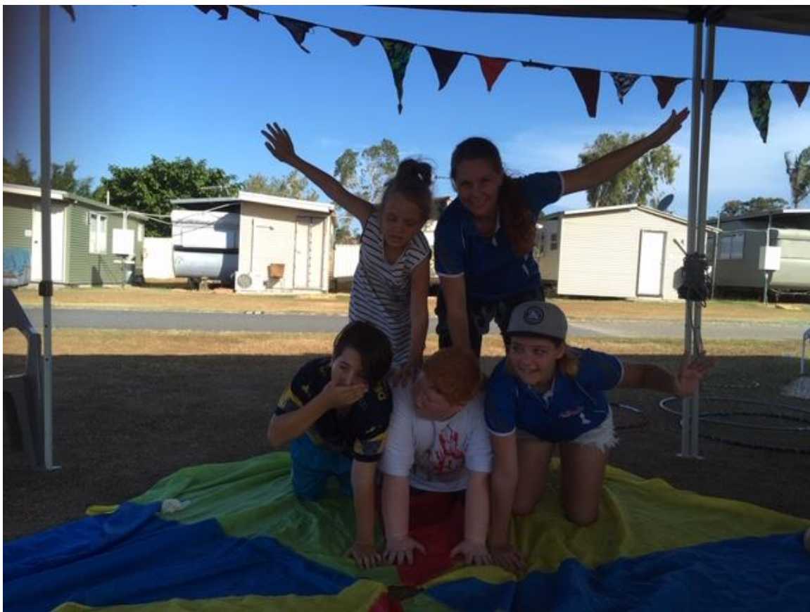
FIGURE 8: CIRCUS CONNECT WORKSHOP

In essence, all of these statements confirm that the social dimension of the activities has a beneficial impact, both individually – overcoming isolation – and for the community.