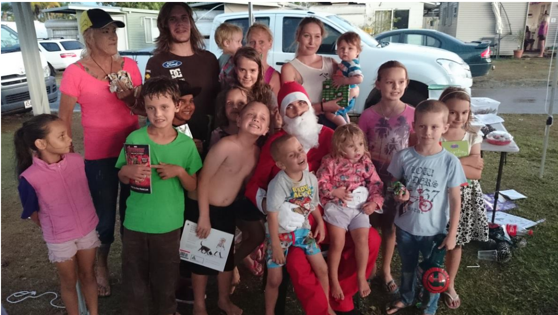
FIGURE 1: RESIDENTS AND CHILDREN AT ENDEAVOUR CHRISTMAS 2018