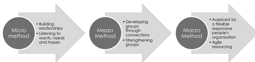
FIGURE 3: MICRO, MEZZO AND MACRO-LEVEL METHOD

The worker demonstrates use of a method that works from a micro starting point, being a good connection between worker and resident to a mezzo process, where more people are drawn into the connection, with the intent to build a group activity or initiative. Similar to frameworks from participatory development practice, the method used by the Project Worker is based on “building relationships” then moving to “strengthening groups” and finally, shifting to macro-level work through partnership with a responsive local organisation (Kelly & Westoby, 2018). Figure three below depicts the method processes.